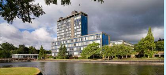
8 CAN YOU RECALL THIS HQ'S HISTORY? Wanted! Memories of the old Pilkington Glass HQ