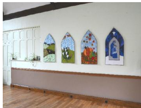
Above: West Haddon Baptist Chapel.

The Group meets once a week and it took 18 months to make the hangings and they finally finished in July 2017.