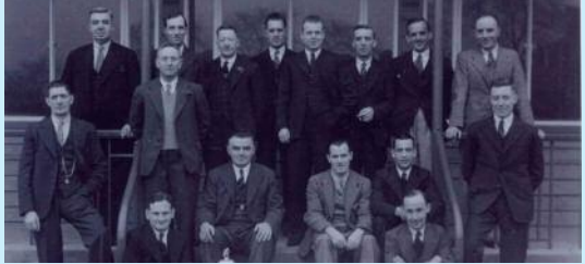
3 PILKINGTON APPRENTICESHIPS IN 1924! Formal indentures to "place and bind"