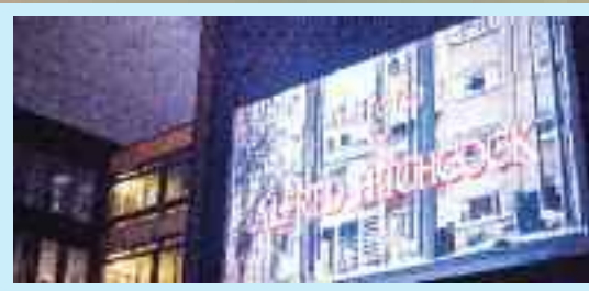
THE REAR WINDOW Screened at former head office