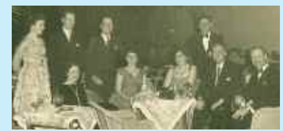
HOBBIES & MEMORIES Abseiling, Rambling, Memory Lane