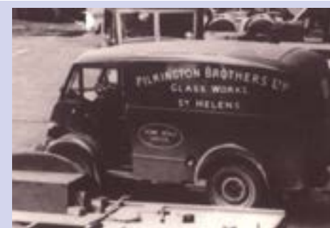
Thankfully the meals vans are better now than they used to be!