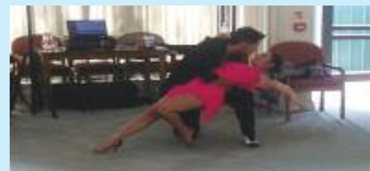
5 STRICTLY COME DANCING Spectacular performances at the Day Centre