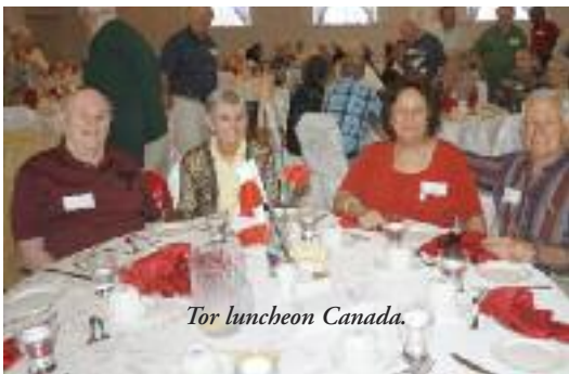
Tor luncheon Canada.