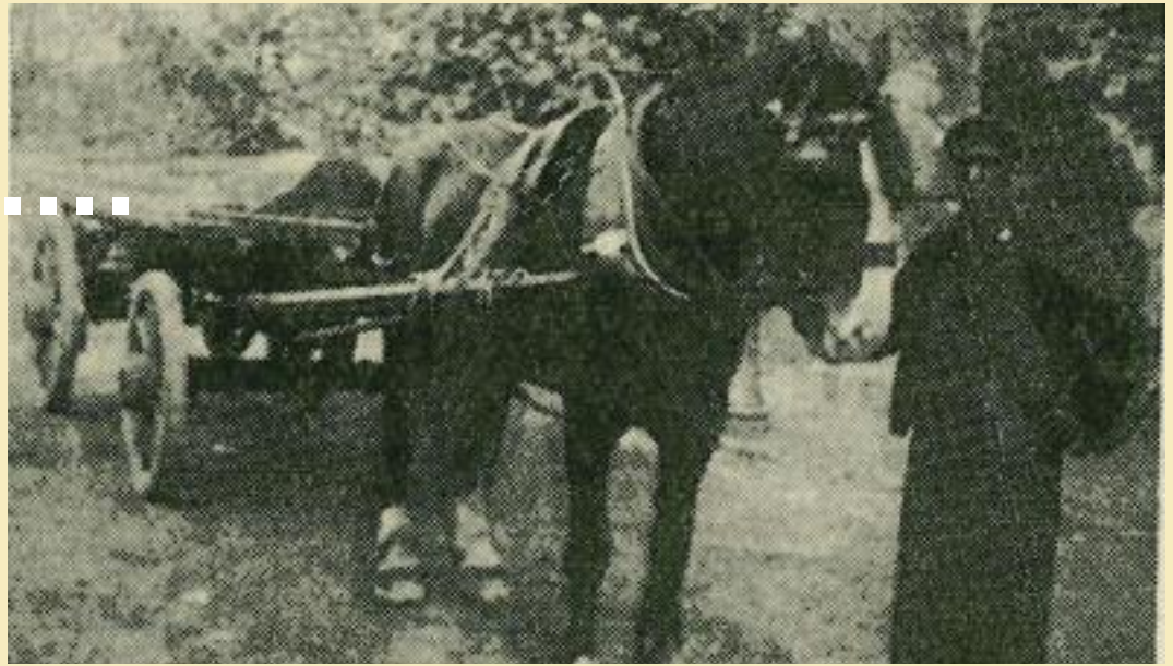
Picture taken from an old Cullet magazine - a time when St Helens was full of horses and when each Works had its own stables.

In those days Mr. "Bill" Howard told me the St Helens/Liverpool trip took from two to two and a half-hours with a cart loaded with 30 cwt of glass. The carter was also responsible for looking after the horse, cleaning harness, cart and stable. The day started at 6 a.m. with giving the horse his breakfast of hay and oats. The first Monday of each month every horse was weighed to see