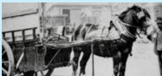
3 AS IT WAS .... A fascinating glimpse of Pilkington history