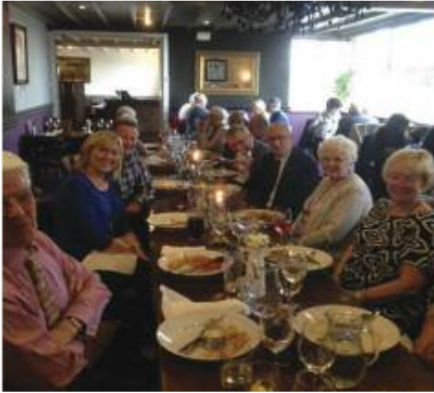
In March 2017, the volunteers from Ruskin Lodge had a lovely day out to the Paddock Cafe in Derby House, Wrightington, Wigan, for coffees and a look around the farmer's market. Later they went to the Corner House, Wrightington, for a delicious three-course lunch: the food and service were excellent and everybody really enjoyed it.