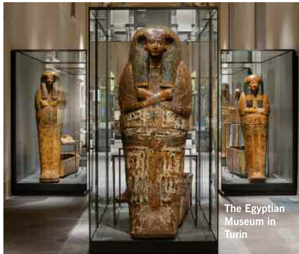
The Egyptian Museum in Turin

The new Egyptian Museum houses 70 cabinets and 103 display cases, using 2,200 square metres of this unique glass. The exhibition spaces, which provide a clear, unobstructed view of artefacts, have improved the viewing experience of visitors and have created a must visit attraction for lovers of archaeology. To find out more visit www.pilkington.co.uk