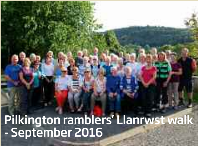
Pilkington ramblers' Llanrwst walk - September 2016