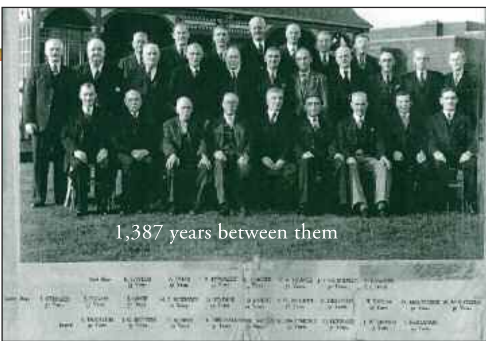
1,387 years between them